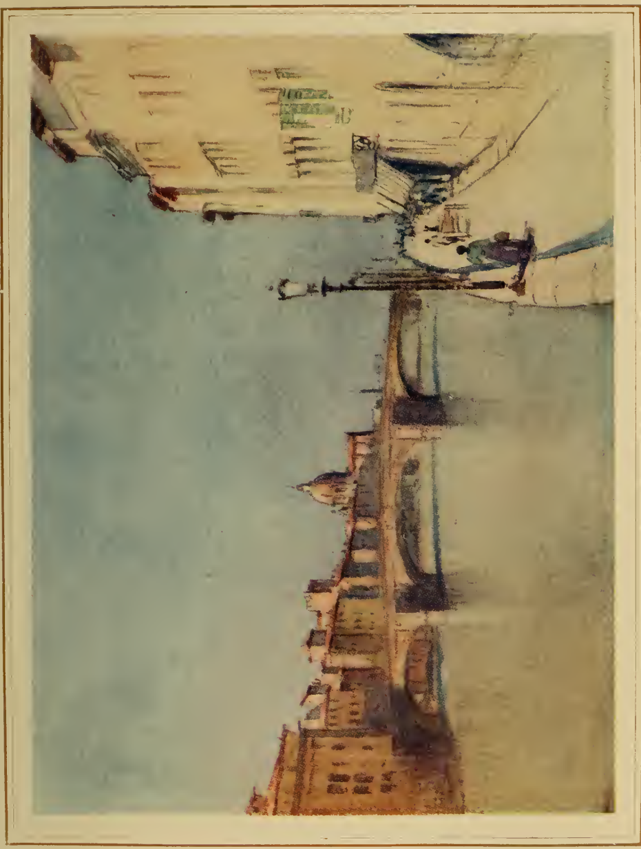
THE PONTE S. TRINITÀ FROM THE LUNGARNO ACCIAIOLI, SHOWING S. FREDIANO IN CESTELLO